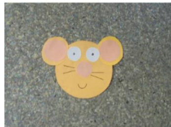
Circles for the Mouse