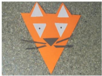
Triangles for the Fox

Cut out shapes and assemble the pieces to make the different characters of the story below: