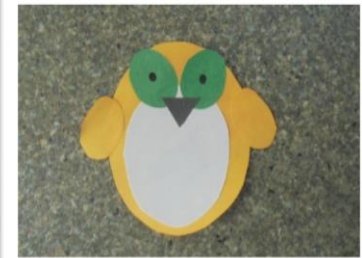
Ovals for the Owl