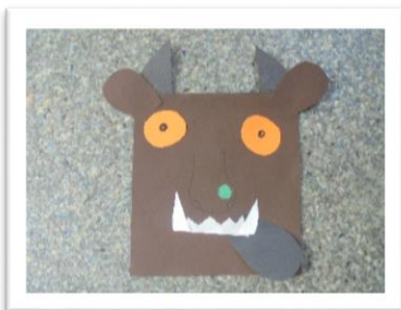
Squares for the Gruffalo and the Snake