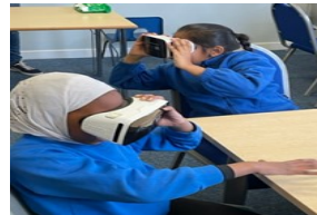
Exploring the temple