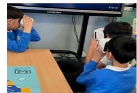
On tour of the village