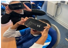
Awe and wonder

Finally, last term, the children learnt about ancient Mayan civilisation. We welcomed a Virtual Reality company into the school for a workshop that explored a range of ancient villages. The experience was amazing and the children came away from it, full of excitement. Please see the images below as a testament to this.