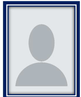
Teaching Assistant TBC